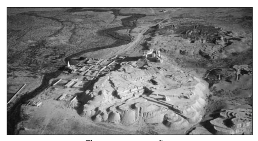
The ruins at ancient Susa

gate (4:1), inner court (5:1), outer court (6:4), palace garden (7:7), and dice (pur) (3:7) (which was a quadrangular prism.)<sup>v</sup>